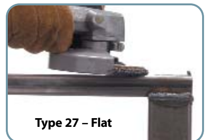
Type 27 – Flat