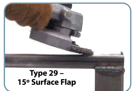
Type 29 – 15° Surface Flap

The layered abrasive flaps on the flap disc are designed to wear away evenly. PowerFlex Discs produce a high-quality, consistent finish on steels, metals, and other exotic materials.