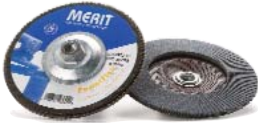
Zirconia Fiberglass 5/8-11 Hub