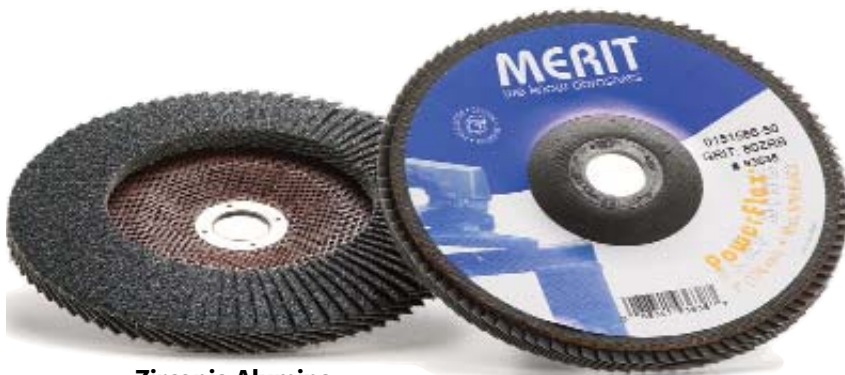
Zirconia Alumina Fiberglass Plate